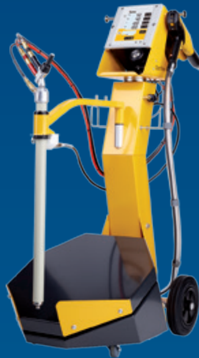
OptiFlex® 2 Q