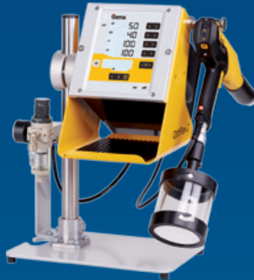
OptiFlex® 2 C