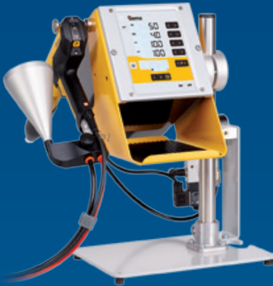
OptiFlex® 2 CF