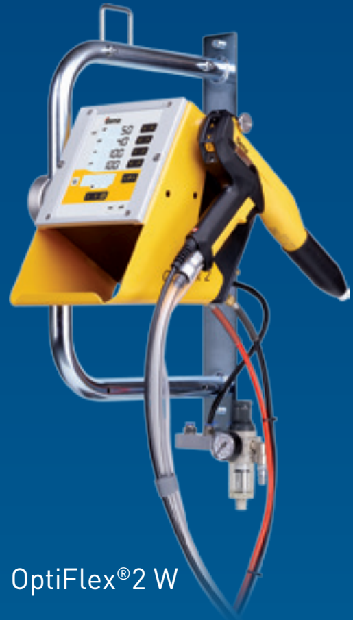
OptiFlex® 2 W