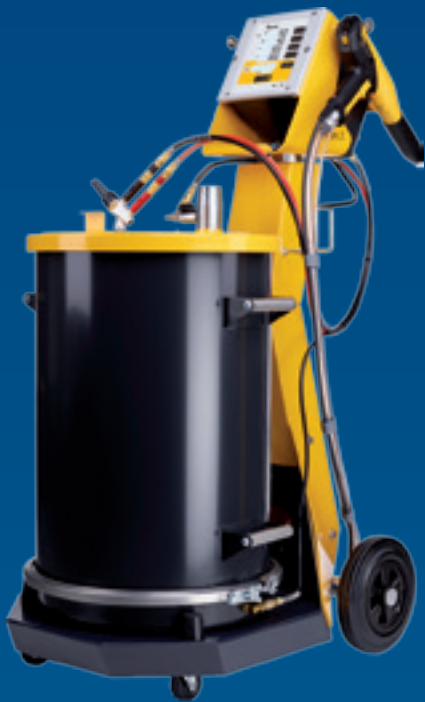
OptiFlex® 2 F