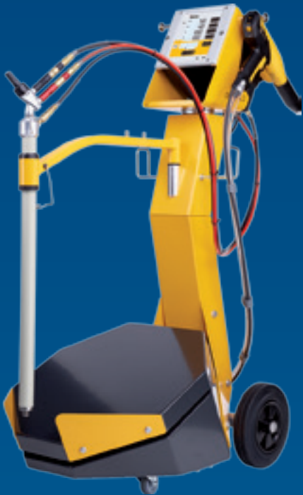
OptiFlex® 2 B