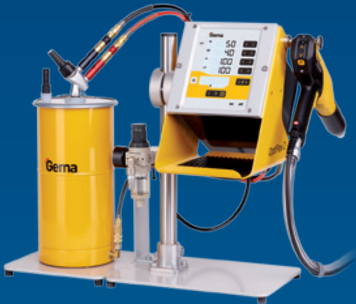
OptiFlex® 2 L