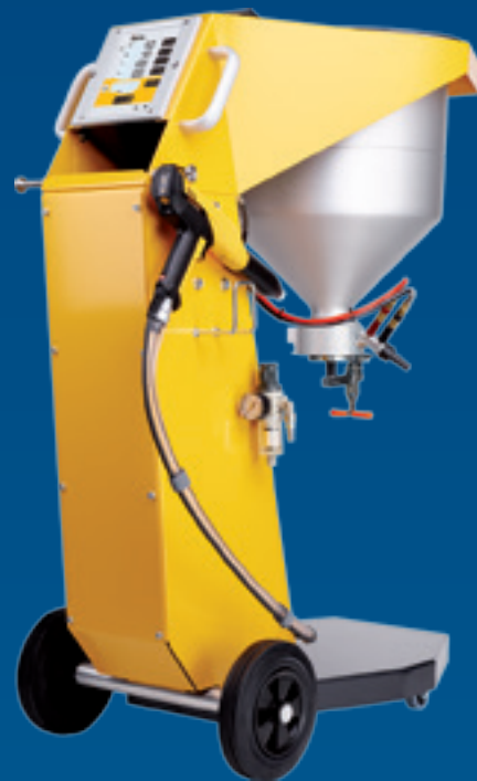
OptiFlex® 2 S